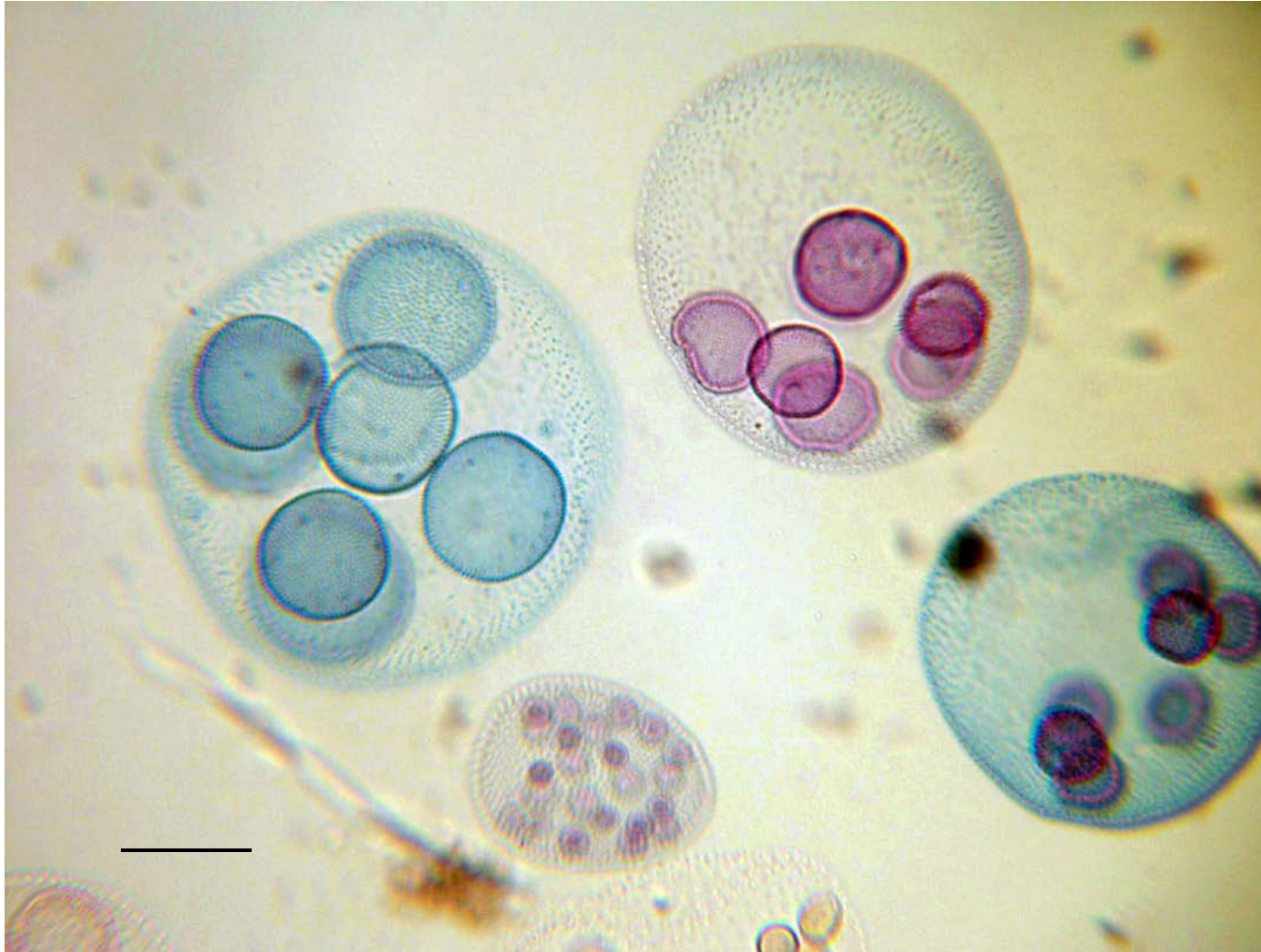
Volvox sp. colonies. Scale bar = 0.1 mm.